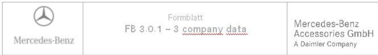
Exhibit 7 Form for Disclosure of Information about Licensee's Company and Activities according to Section 8.12

Mercedes-Benz Accessories GmbH · Am Wallgraben 125 · D-70565 Stuttgart